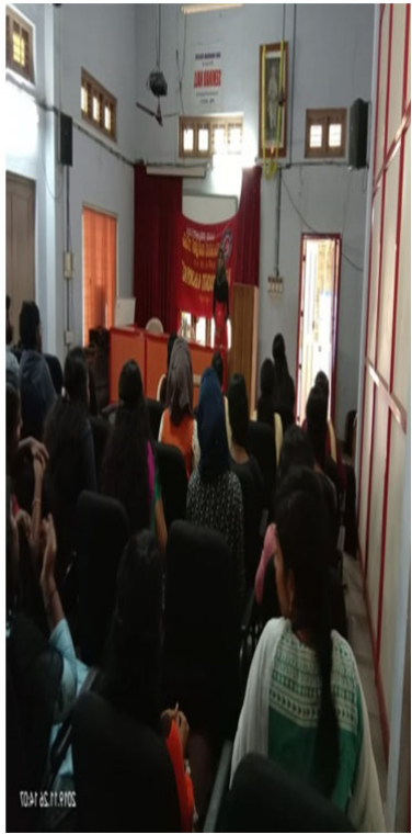
AIDS DAY POSTER MAKING