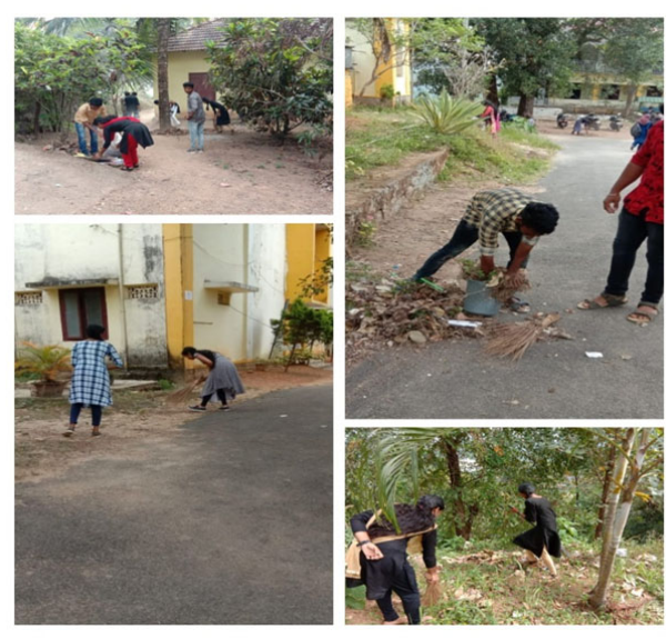
volunteers sincerely participated in this event. 9 am to 10 am is the scheduled time for cleaning. It was mainly in accordance with Christmas.